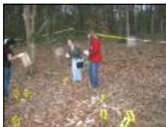
Investigating crime scene