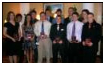
FBLA Award Winners